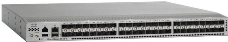
Figure 7. Cisco Nexus 3548-XL and 3524-XL Switch

The Cisco Nexus 3548-XL and 3524-XL have the following hardware configuration: