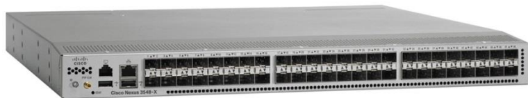
Figure 4. Cisco Nexus 3548-X and 3524-X Switches

The Cisco Nexus 3548-X and 3524-X have the following hardware configuration: